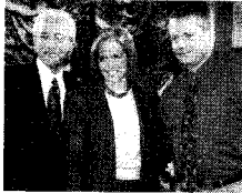
NPDF Legal Defense case profiled on the NBC Today Show.

The NPDF offers (via its member attorneys) a free legal consultation to its members who experience a job related legal problem.